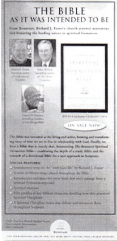
Ad appearing in the July 2005 issue of Christianity Today (shown about 1/2 actual size)

—PUBLISHERS WEEKLY [this secular trade journal is politically—and religiously—"correct"]